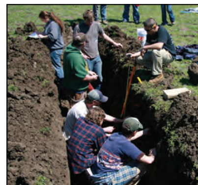
HSU students in the pit